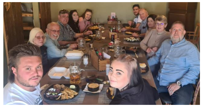
The Brethren and their ladies enjoying their meal

The Brethren of Star of the West decided that they needed to celebrate National Women's Day properly, so they took their ladies out for a meal. This is a great idea and we'd like to see much more of these teambuilding activities. Well done!