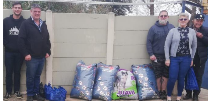
Lodge family members donating supplies

In keeping with the Grand Master's vision for community involvement, Star of the West has lent a "helping paw" to the Orkney and Klerksdorp Animal Shelter with a generous and much needed donation of pet food and other much needed items. They challenge local businesses in the area to follow their example.