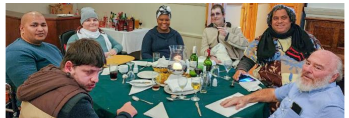
Our Quadriplegics and their support team