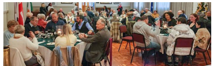
The well filled dining area