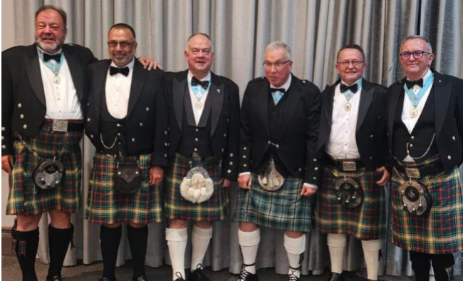
Brethren of the GLSA in "highland" dress