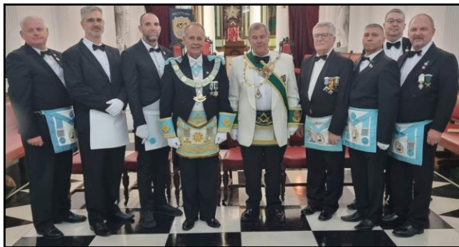
The Grand Masters surrounded by de Goede Trouw members

I've always believed that Freemasonry should be a Quality experience with memorable times shared by our Brethren. It should be Fun – and this really was!