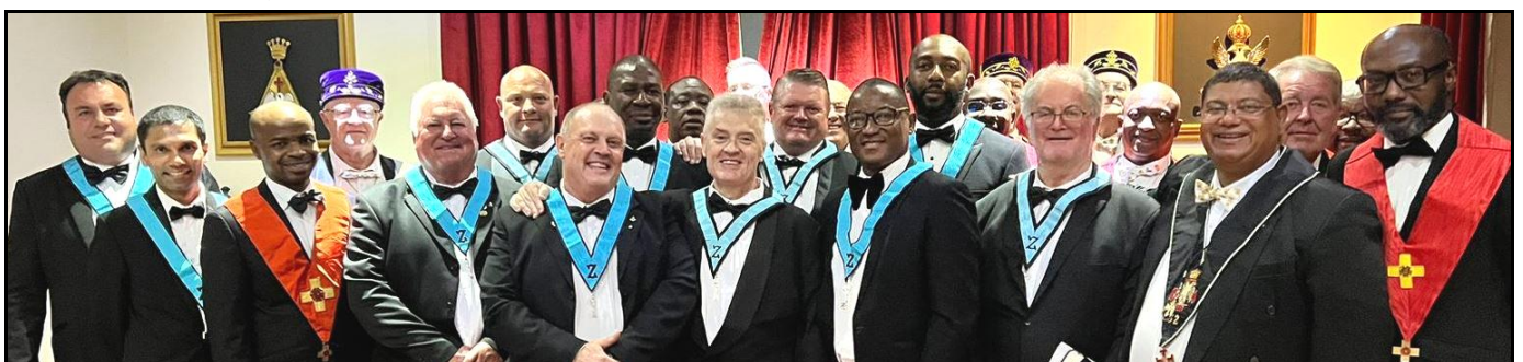
The Brethren at the Eendracht Maak Macht 4 th degree working

Never regret a day in your life. Good days give you happiness, bad days give you experience, worst days give you lessons, and best days give you memories.