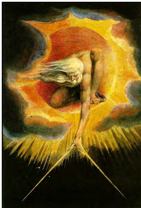
The Ancient of Days Measuring Time, 1794 William Blake