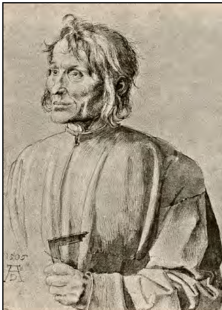
The Architect by Albert Durer